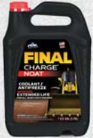
FNAOB3 1 Gallon Concentrate Bottle Gallon UPC: 074804-03349-6 Case UPC: 074804-13349-3 Case SCC 14: 1-0074804-03349-3