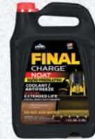
FNAB53 1 Gallon 50/50 Bottle Gallon UPC: 074804-03358-8 Case UPC: 074804-13349-3 Case SCC 14: 1-0074804-13358-5