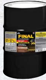
FNAB51 55 Gallon 50/50 Drum 0-74804-05377-7