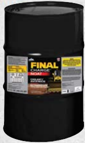
FNAOB1 55 Gallon Concentrate Drum 0-74804-05376-0